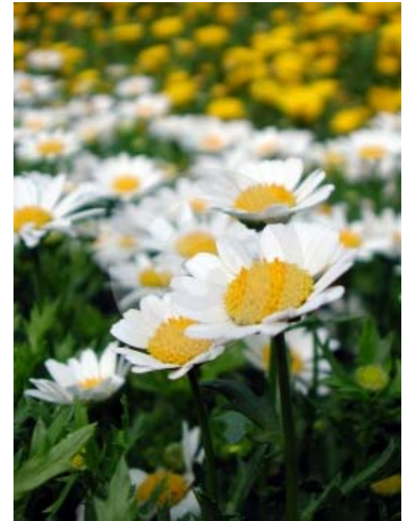
Location of New Life Treatment Center Woodstock, MN